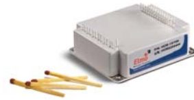
Hornet Intelligent Digital Servo Drive

The Hornet is very compact, measuring just 55 x 15 x 46.5 mm and weighing only 50 g. It delivers up to 3.3 kW of peak power and 1.6 kW of continuous power.